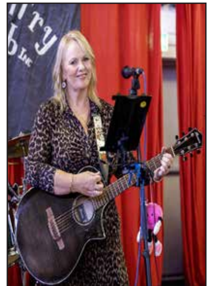
Workin Overtime with Scott Dann