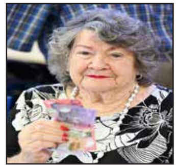
Some of This months Lucky winners!