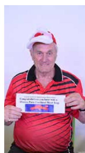
Some more lucky winners!