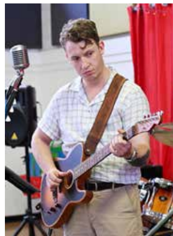
Step up Singer