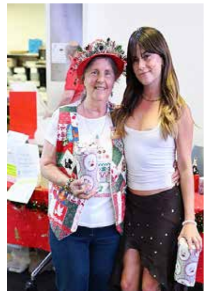
Monte Carlo Winners