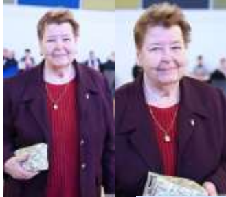
All our Lucky September raffle winners