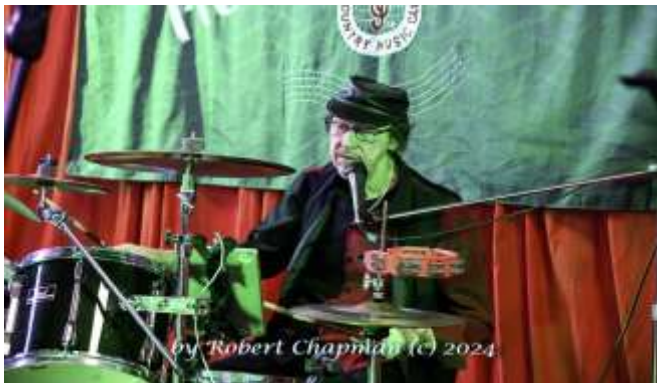
Rocky of Workin Overtime