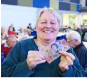
September winners of the Lucky Squares