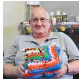
Winner, Winner Chicken Dinner! Or in this case our lucky raffle prize winners!