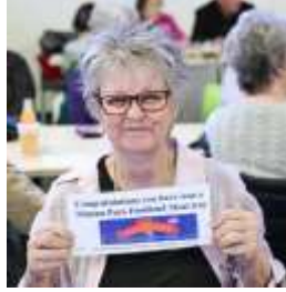
Meat Tray winners!