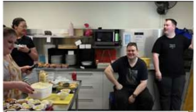
My Family Getting Ready For Desserts