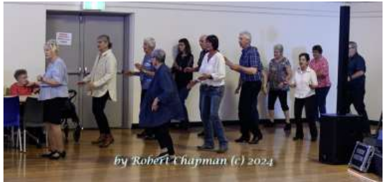
Boot Scooting Corner