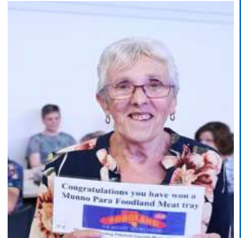
The Winners of the Foodland Meat Trays with their Vouchers.