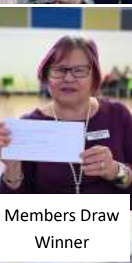
Members Draw Winner