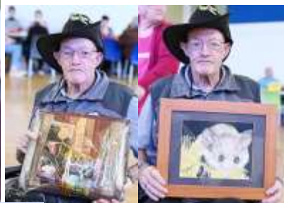
Monte Carlo Winners!