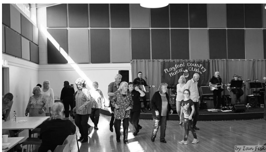
Line Dance Corner