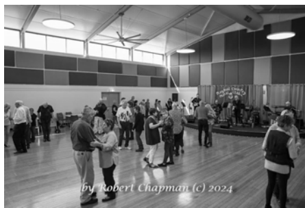
Happy people on the dance floor