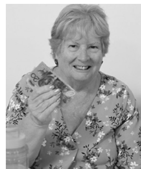
Another happy lucky square winner