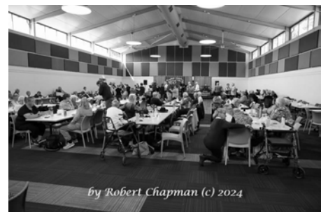
The heart and soul of our club