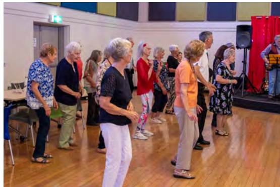
Our line dance corner