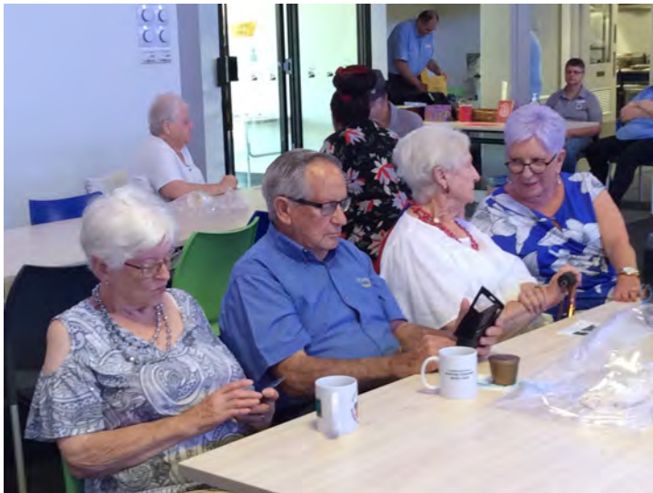
Patrons relaxing during the band break