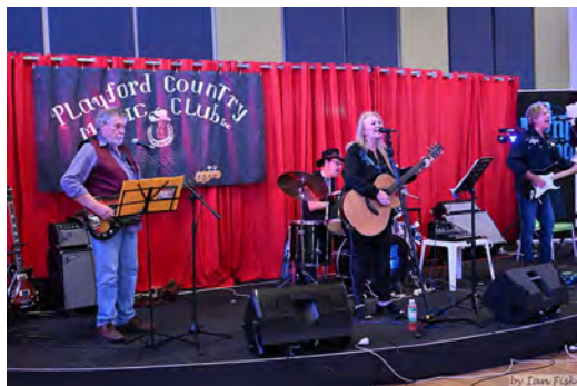
Our band for January was One Night Stand