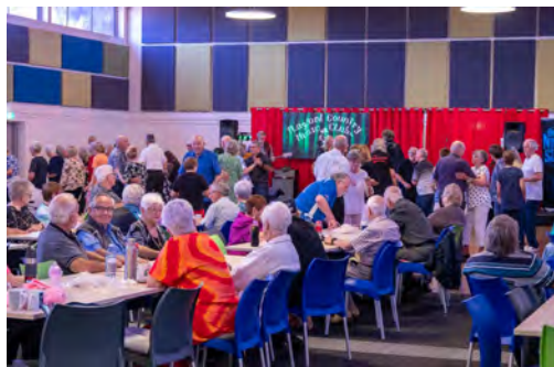
The hall was filled and the dance floor was busy