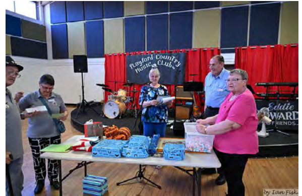
Where all the action takes place to give out the prizes.