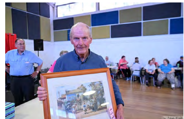
Another happy raffle winner.