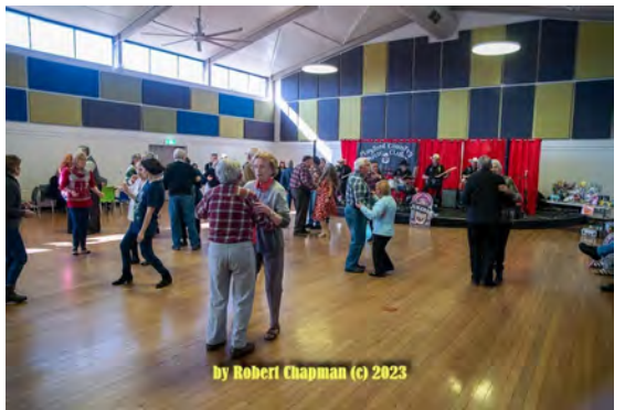
More people enjoying the music and dancing.