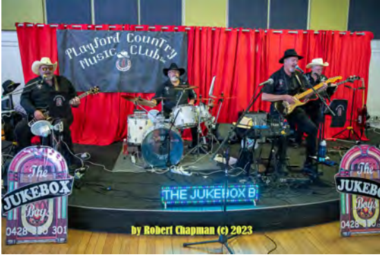
The Juke Box Boys