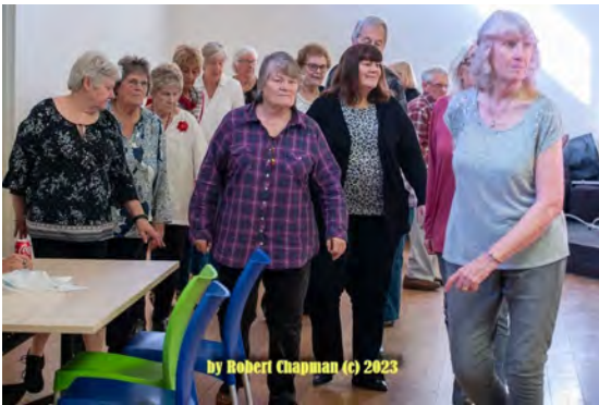
Obviously another popular song they're line dancing to.