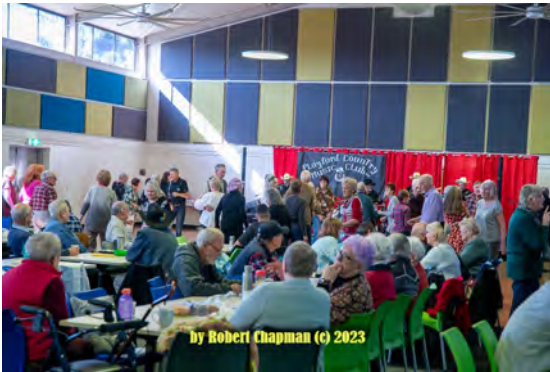
Our busy dance floor