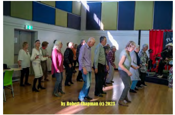
I think they're dancing to Achy Breaky Heart. That always gets everybody up