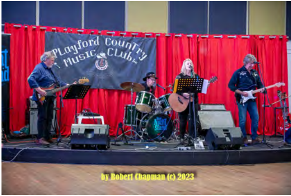
One Night Stand