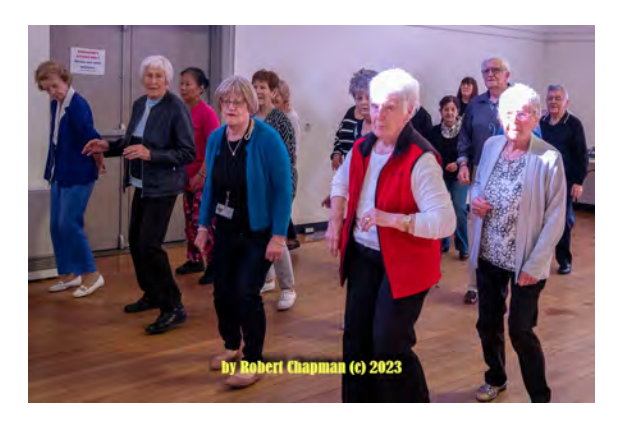
Our line dance corner