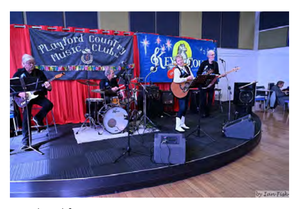
Our band for May-Key Country