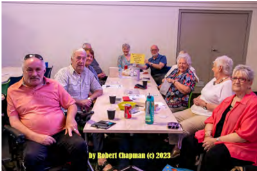
Group from Angle Vale Retirement Village