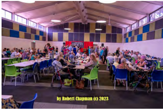
Our patrons enjoying themselves