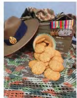
RIP GRANDAD 🇺🇸