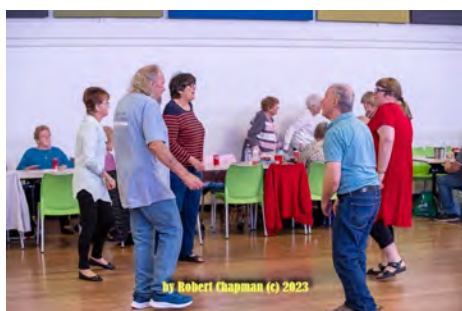
Members and volunteers from Beyond Blindness