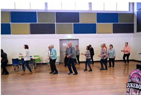
Our line dance corner