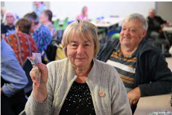
Left: Another lucky square winner.