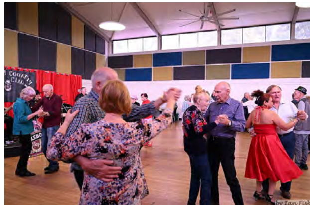
Right: Some of the dancers enjoying the music.