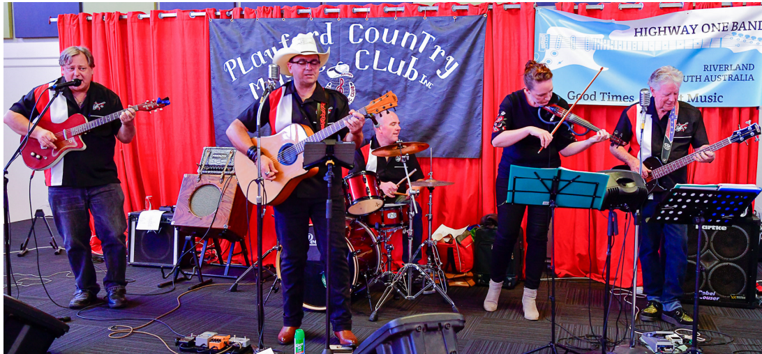
Above: The Band Highway One.