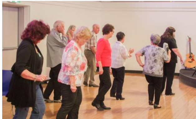
It's always busy in Line Dance Corner