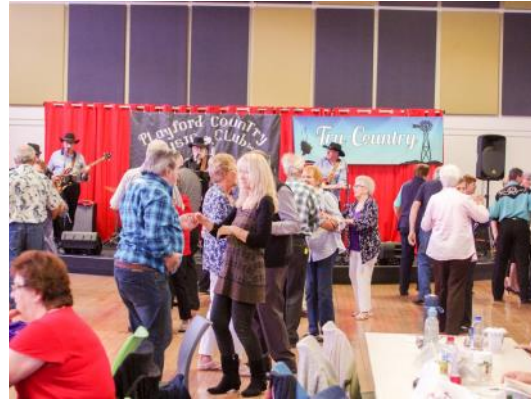
People on the dance floor at the April Show