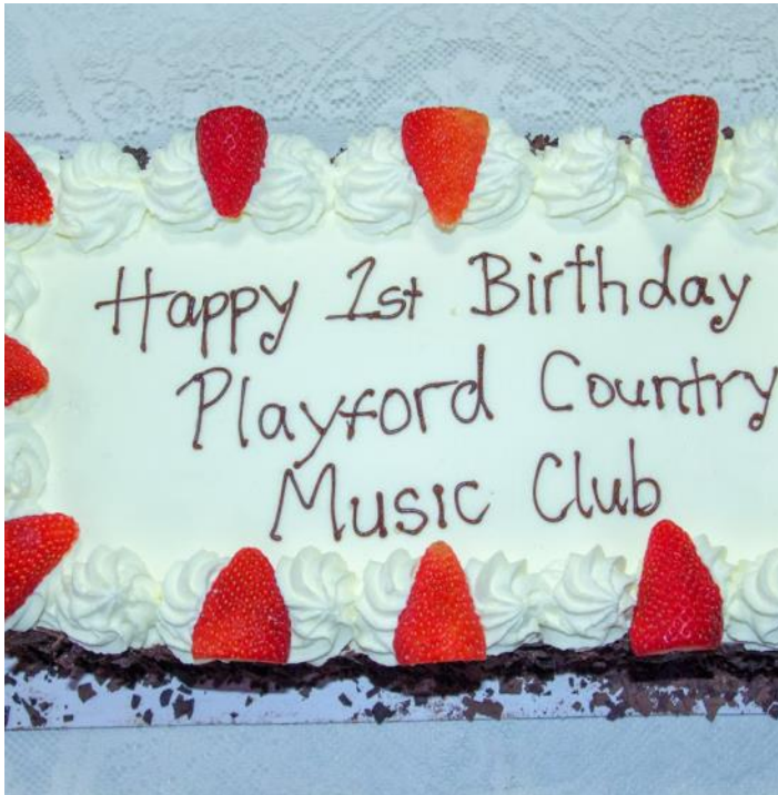
Happy first birthday to Playford Country Music