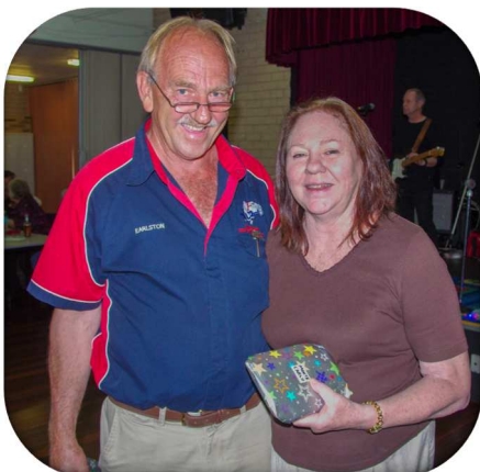
Monte Carlo Winners