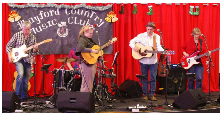
Below Right– Our busy dance floor