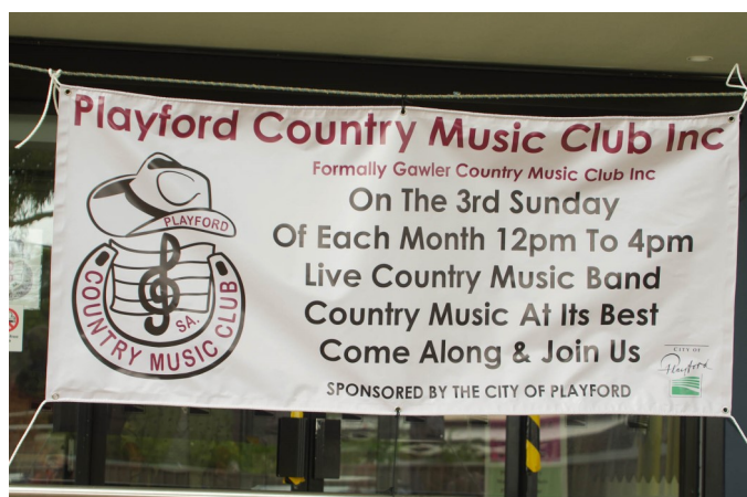
Our new banner