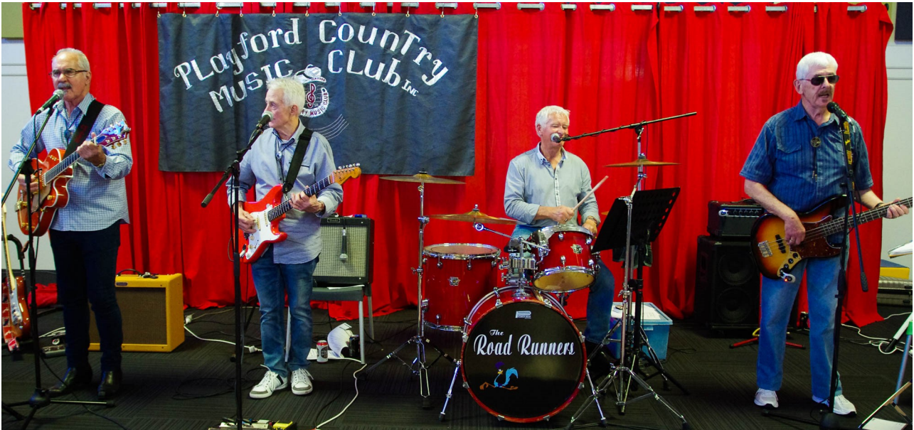
The Road Runners