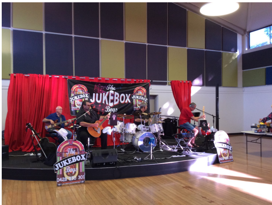
Saturday 17th Nov Rock N Roll Show featuring the Jukebox Boys