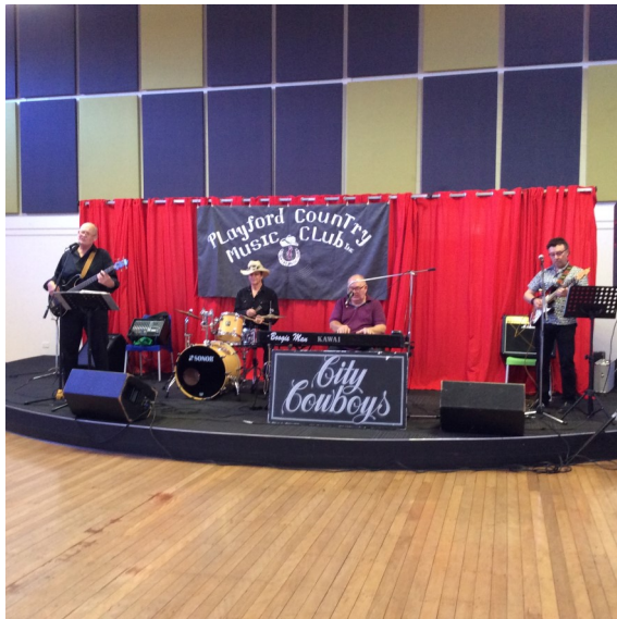
November show band, City Cowboys