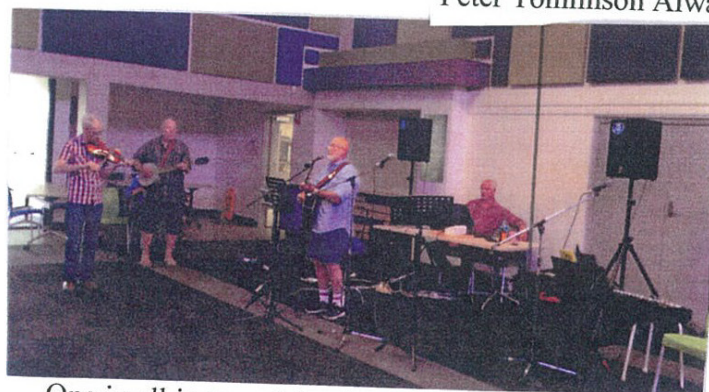
One in all in to end the day. Well done Guys